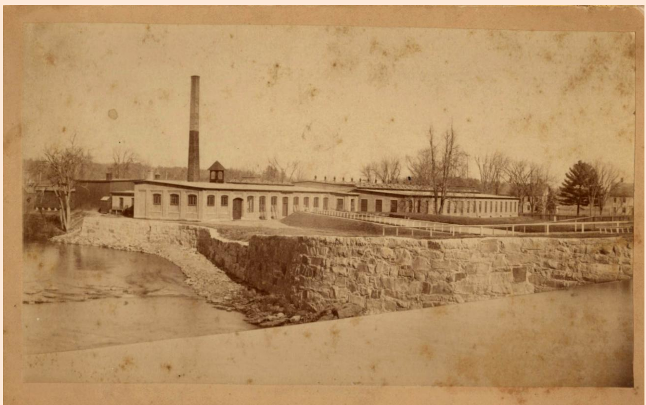
GINGHAM MILL AT SAWYERS MILLS Sawyers Mills Boylston, Massachusetts

Sawyers Mills factory closed its doors. The Historical Society holds a vast amount of information on Sawyers Mills – an active village and important part of Boylston up until the Wachusett Reservoir was built and the land was then entirely buried under water. Artifacts, information, and photographs are in the new Sawyers Mills Exhibition that we hope you will visit on Memorial Day. Additional articles on Sawyers Mills are also to be found in our Fridays Fascinating Finds articles and Then and Now articles.